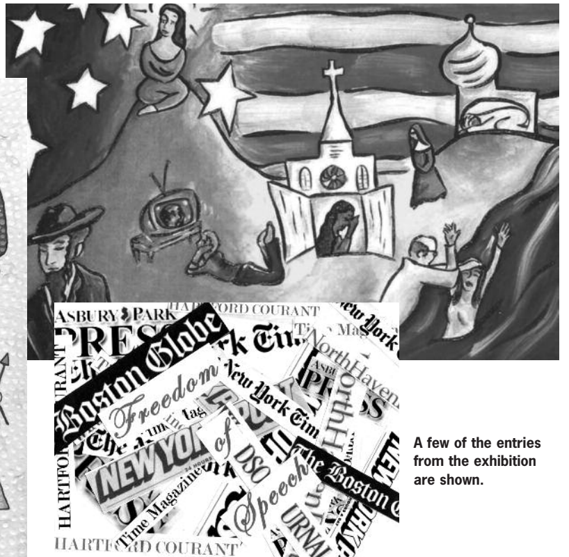
A few of the entries from the exhibition are shown.