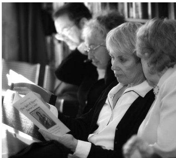
For more information on the dedication of the new Marian Center, see page 8.

If you would like to receive @lbertus, the monthly e-mail newsletter and its special edition updates on news at Albertus, just e-mail your name, class year, home address and preferred e-mail address to: alumni@albertus.edu . The Office of Alumni Relations respects your privacy and does not share e-mail addresses.