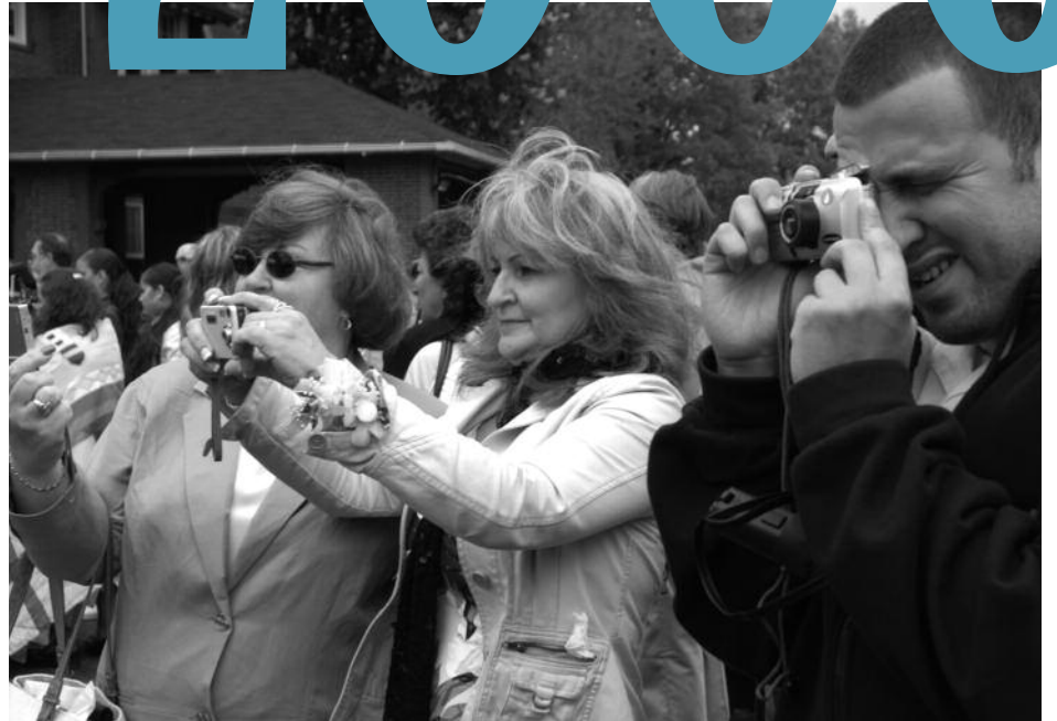
Family photographers try for the perfect shot.