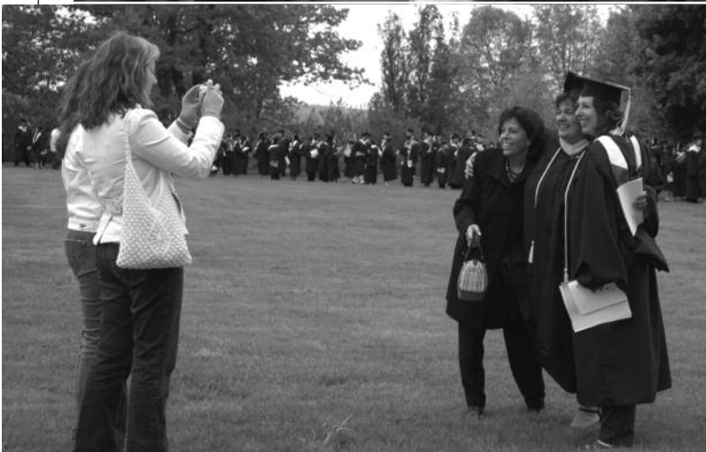
Just one more...with a smile.