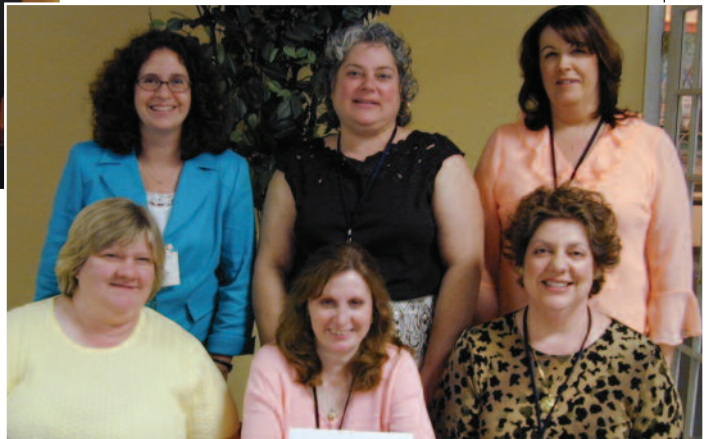
These classmates smile for the photographer.