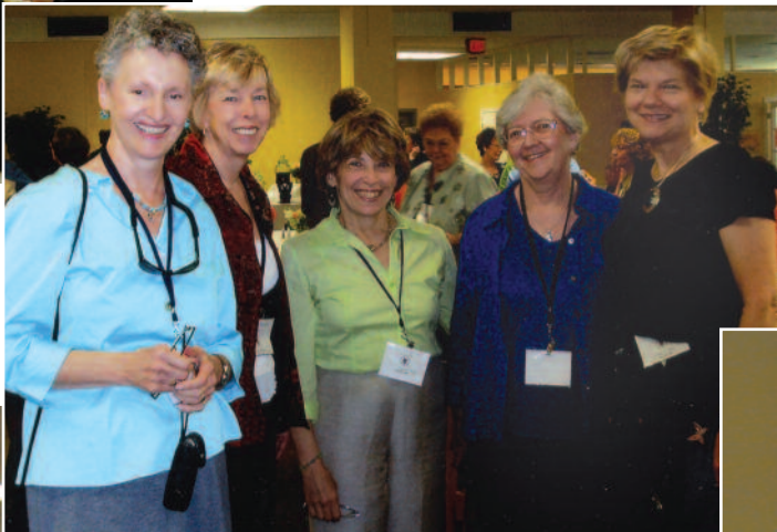
Friends enjoy the festivities.