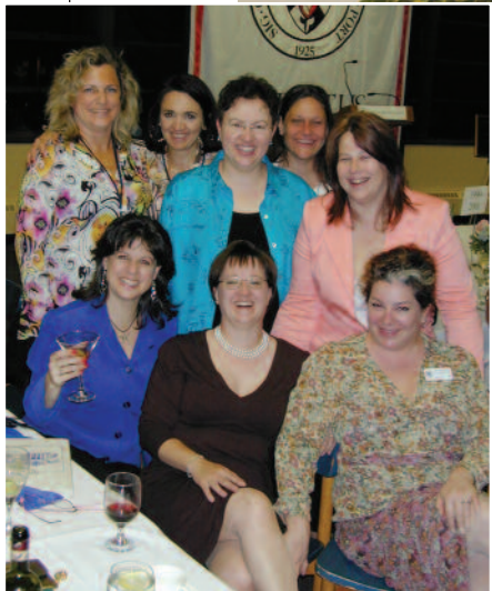
The Class of 1986.