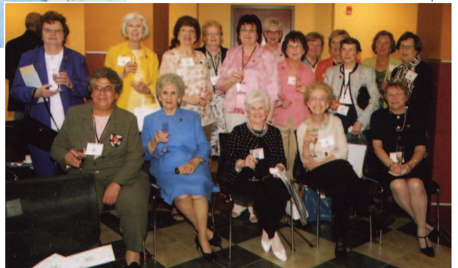
Meet the newest members of The Golden Society: the Class of 1956.