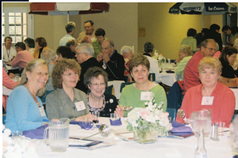
The class of 1971.