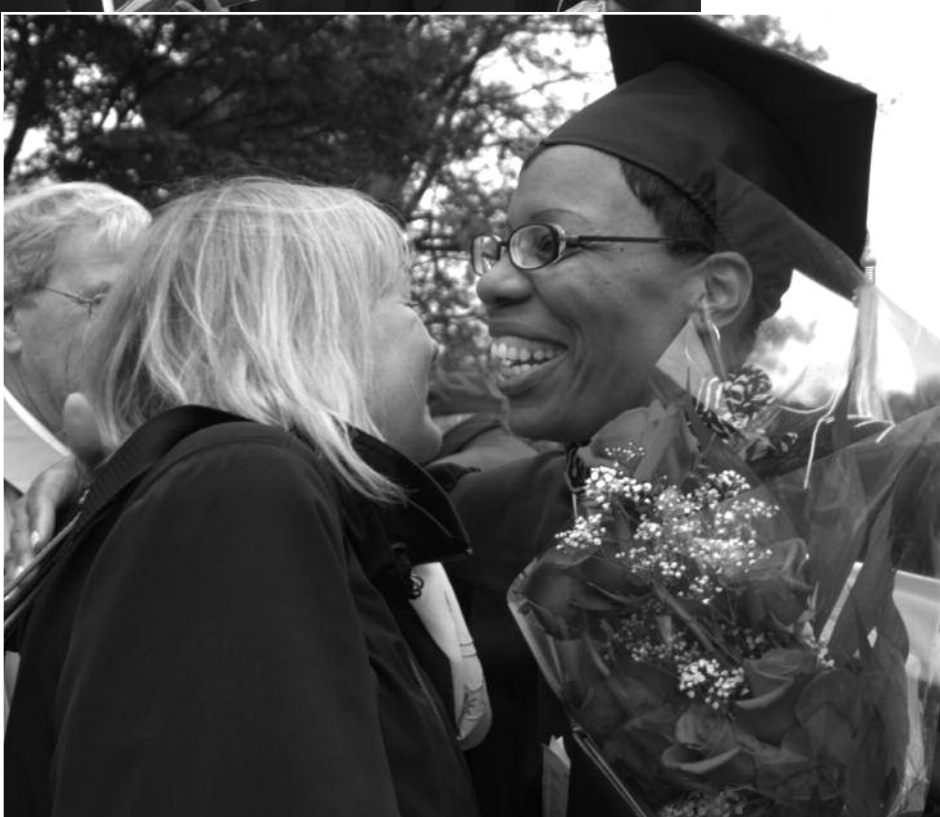
Flowers, smiles and hugs were the order of the day.