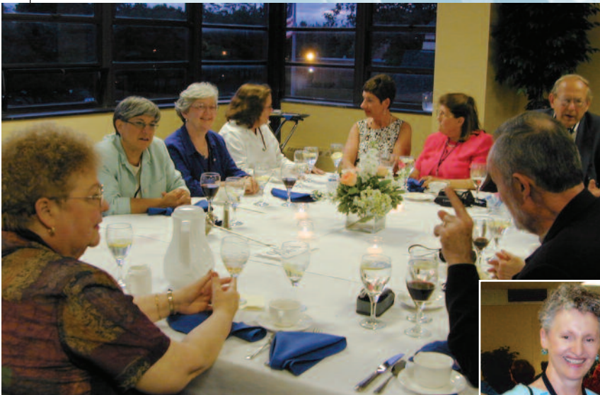
Alumni gathered for dinner in the DeDominicis Dining Hall of the newly-named Hubert Campus Center.