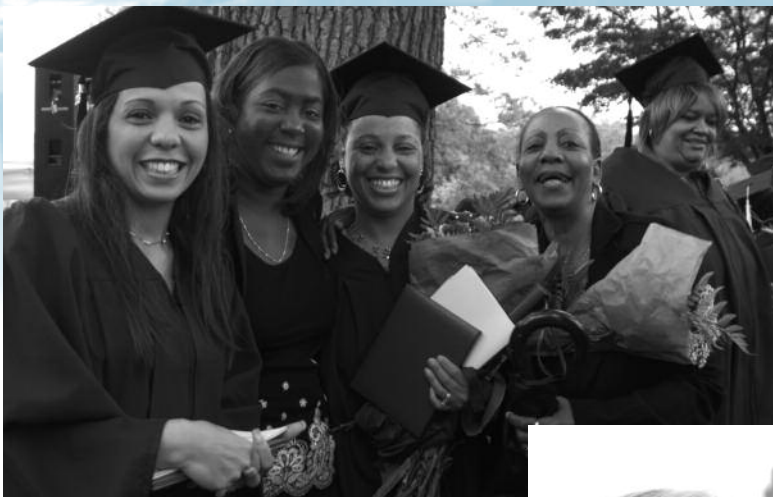
At the College's 83rd Commencement on May 14, 797 undergraduate and graduate students received degrees.