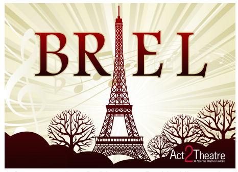
The musical "Jacques Brel is Alive and Well..." and coming to Act 2 Theatre in April. Make your reservation today!